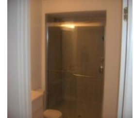
How about a walk-in shower for your elderly parents? It has a built in seat too.

before and after pictures of our latest projects at CER-CAPinc.com.