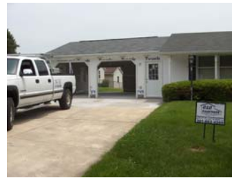
C&C Partners has had a banner year so far with major additions. Here, a two car garage is going up!

Along with our in house team members, C&C has carefully developed solid partnerships with other local sub contractors. These companies are carefully screened, licensed, and insured to offer only the best service to you under our flag. Check out our Web site for more details at CERCAPinc.com.