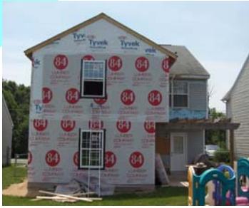
A two story addition under construction by C&C in Brunswick, MD